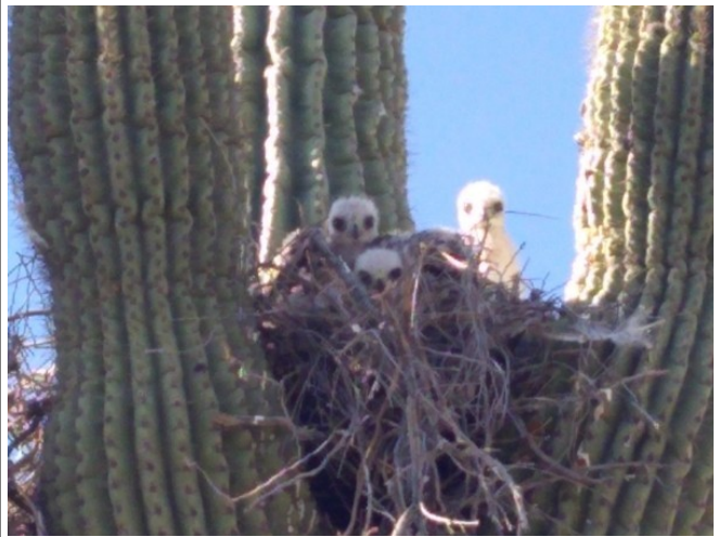
Here you see the three chicks 20 days earlier than the photo to the left. 200503