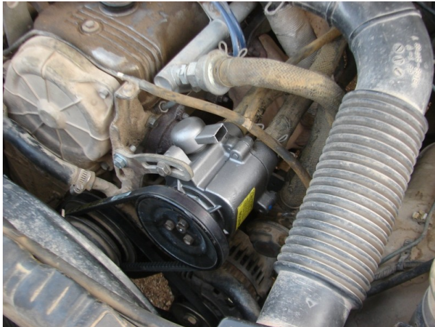
Shiny New Smog/Air Pump in TinyTruck