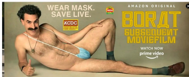
2020's Well Dressed Nudist Wears a Mask