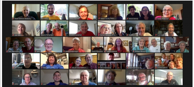
Kalloch Family Annual Reunion Via Zoom