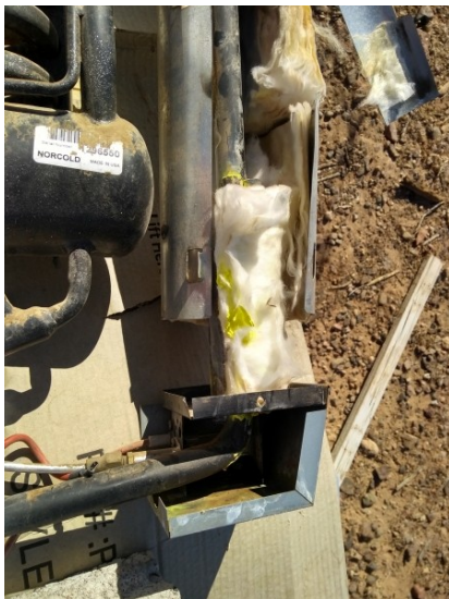
Failed Cooling Unit Showing Yellow Stain of Sodium Chromate Leak.