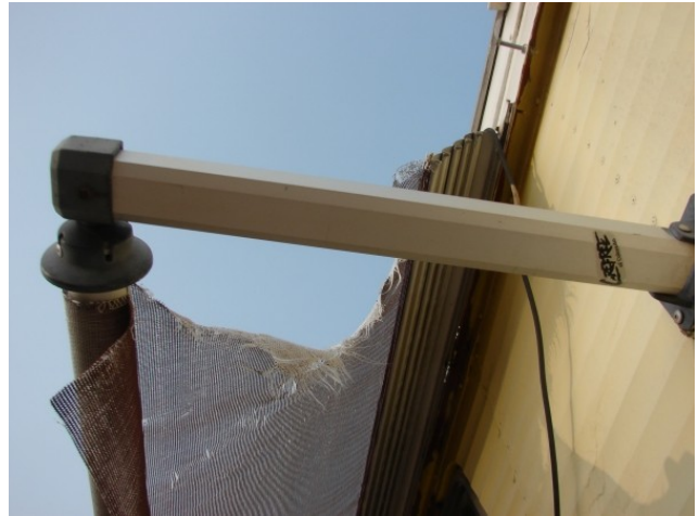
I spent my Pacification Payment to replace three of The.Cat Drag'd Inn's twenty year-old window awnings.