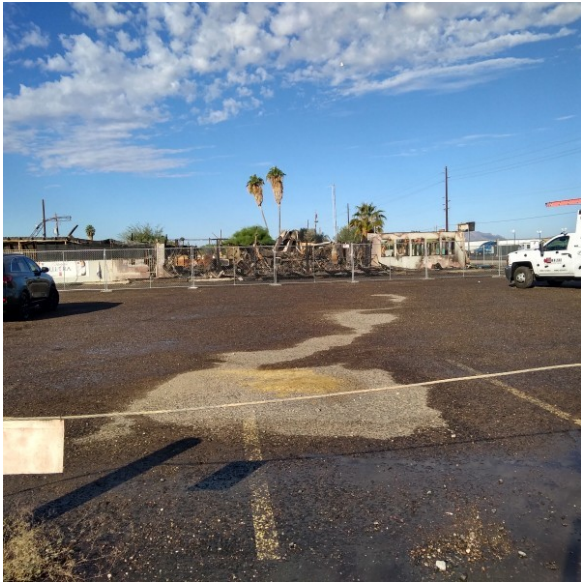
In other MMXX news Tonopah Landmark Oscar's Family Restaurant & Taco Tuesday Emporium burned to the ground.