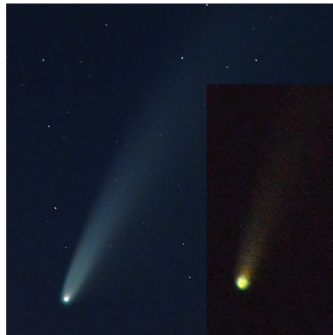
In July Comet Neowise was visible in the northwest sky over Tonopah. Composit Lingel (L), Schrody(R)