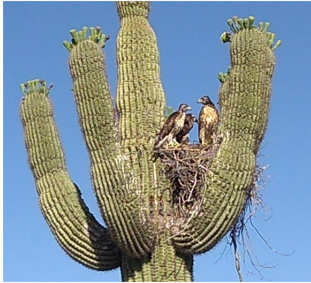
Three Red-tailed Hawks in a Saguaro 200523